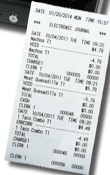
Electronic Journal Report sorting only voids shown 75% actual size.

The journal can be archived electronically for printing at end-of-day, or can be collected on an SD card. A variety of electronic journal options are available that allow you to quickly audit selected activities.