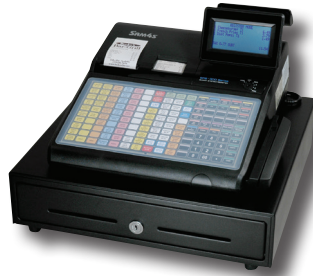
SPS-340 Flat, Spill-Resistant Keyboard; Receipt and Journal Printers