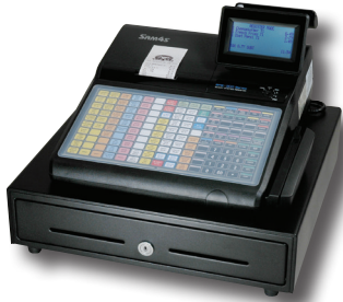
SPS-320 Flat, Spill-Resistant Keyboard; Receipt Printer