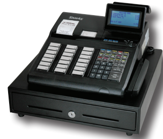
SPS-345 Raised-Key Keyboard; Receipt and Journal Printers